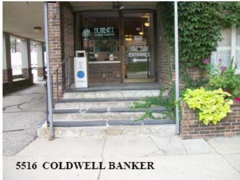
5516 COLDWELL BANKER