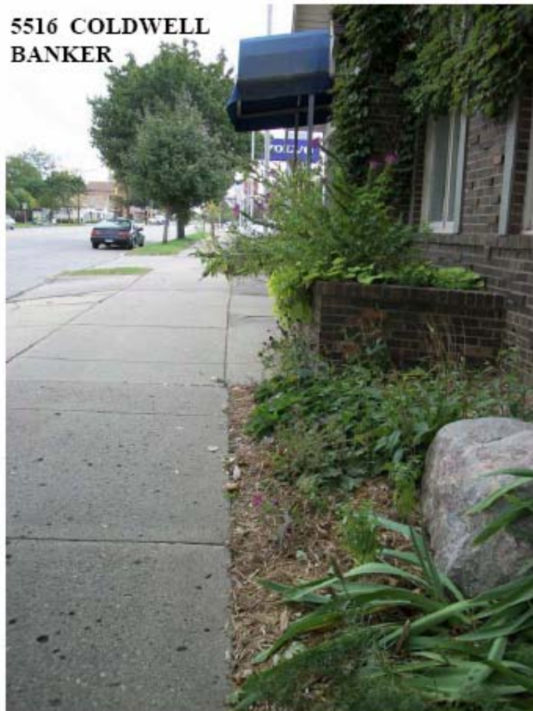
5516 COLDWELL BANKER